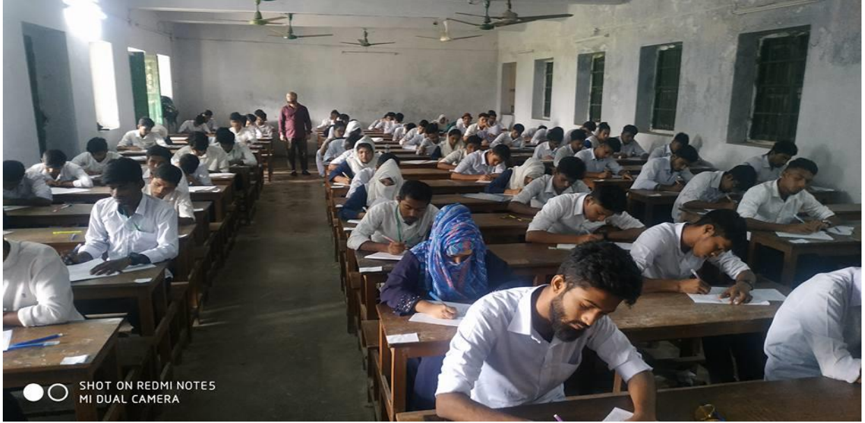
পরীক্ষা হলের চিত্র (ফাইল ফটো)