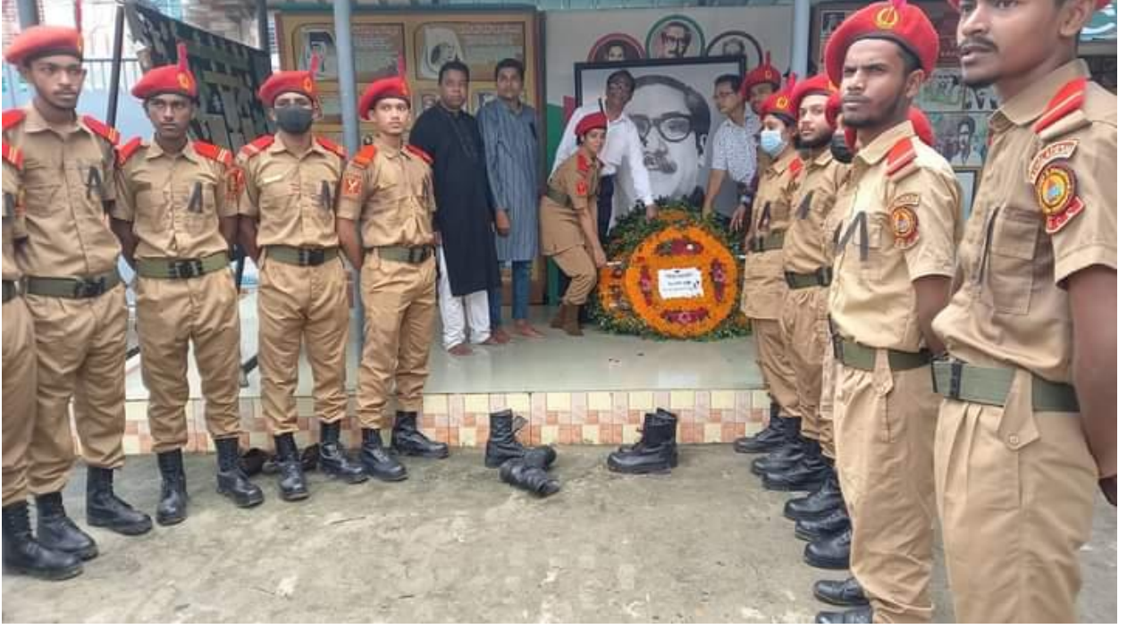
জাতীয় শোক দিবসে বি এন সি সি প্লাটুনের শ্রদ্ধা নিবেদন