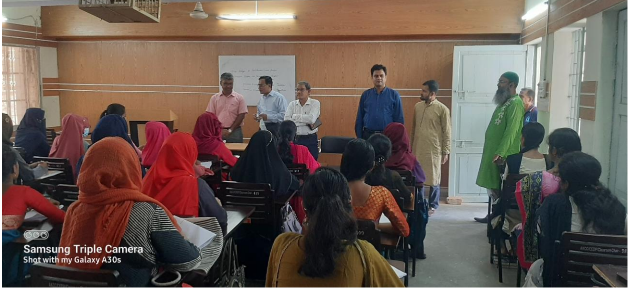
কলেজের শ্রেণীকক্ষে পরিদর্শনে বিশ্বব্যাংকের কর্মকর্তাবৃন্দ