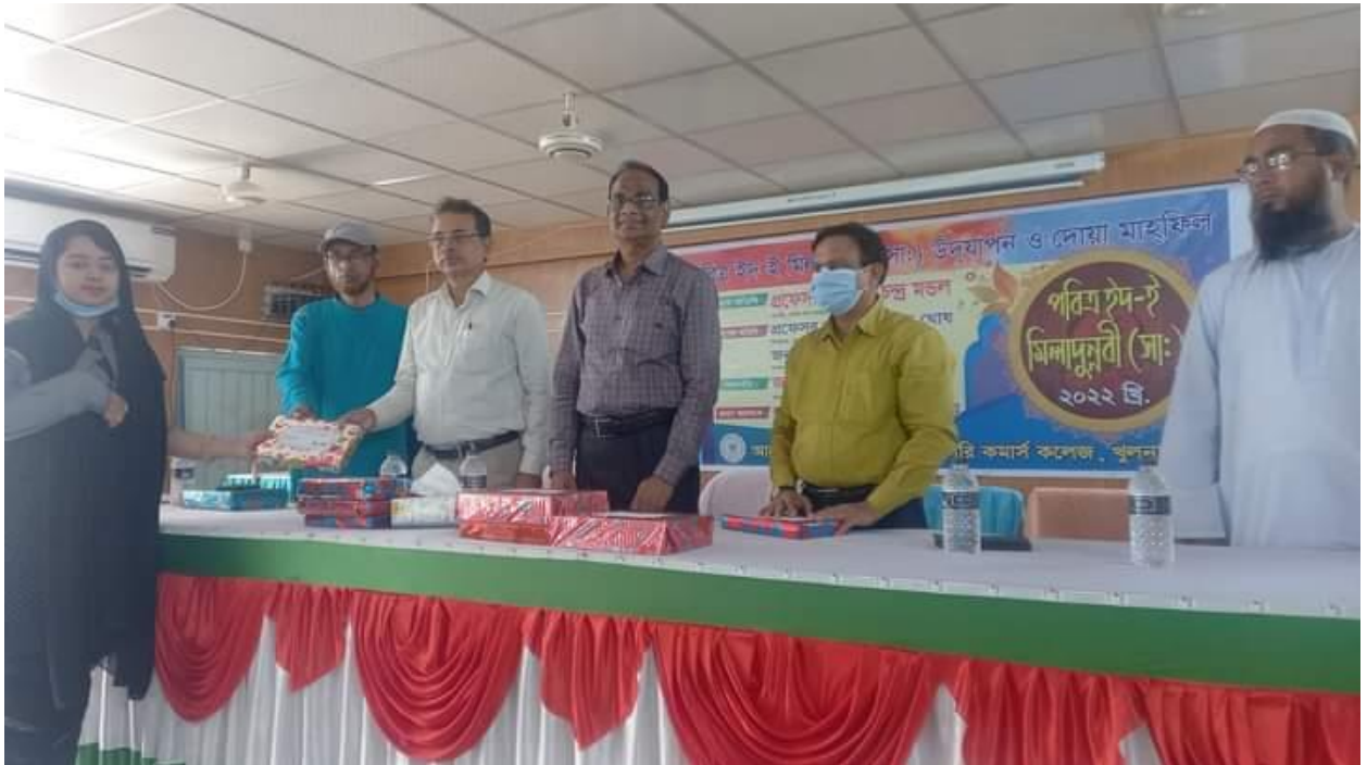
পবিত্র ঈদ-ই মিলাদুন্নবী (সা:) উদযাপন ও দোয়া মাহফিল