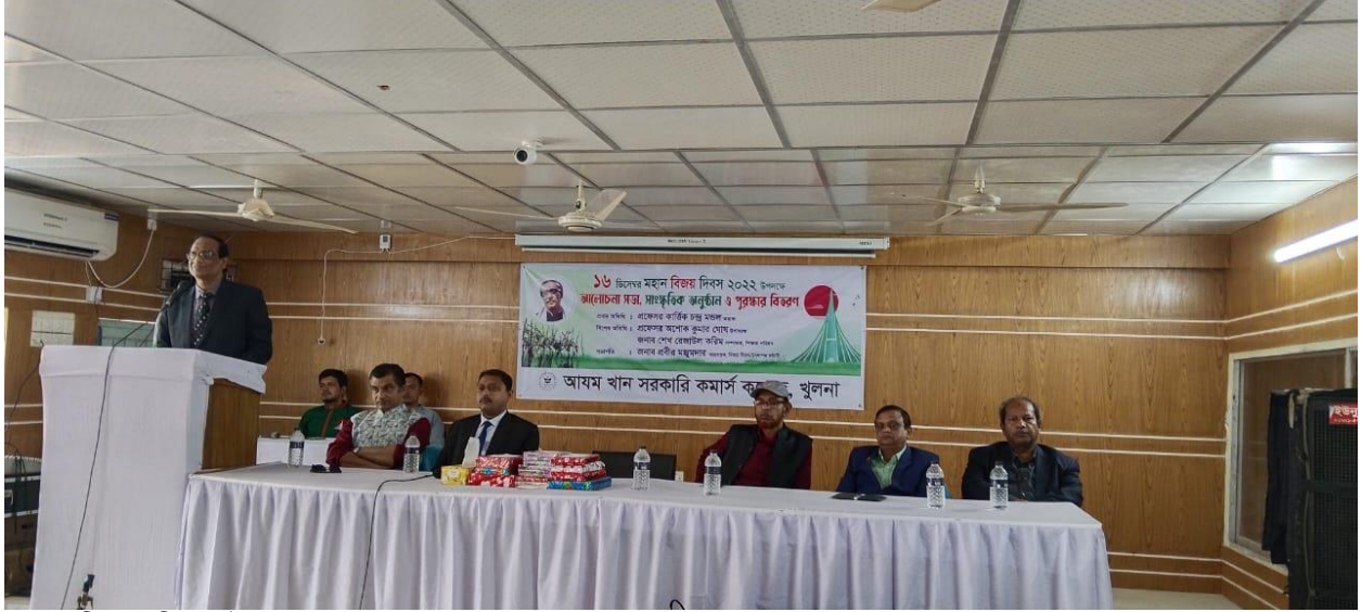
মহান বিজয় দিবস উদযাপন