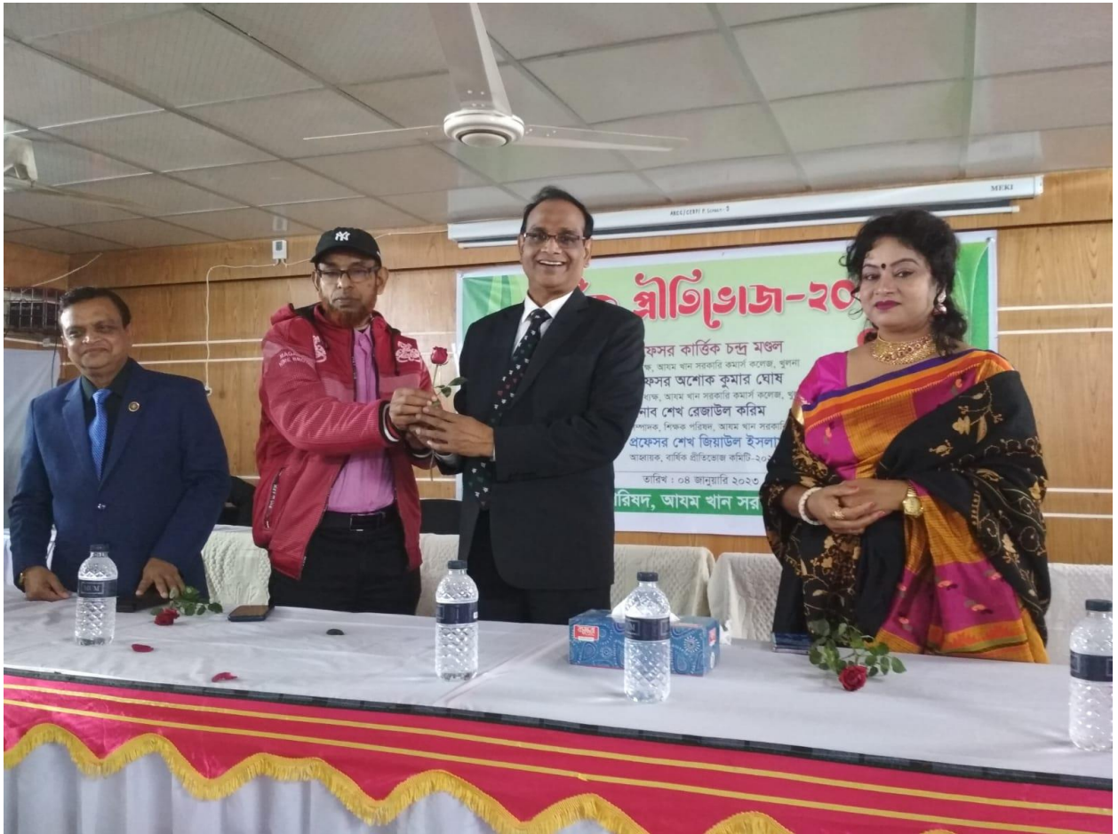
শিক্ষক পরিষদেও বার্ষিক শ্রীতিভোজ - ২০২২