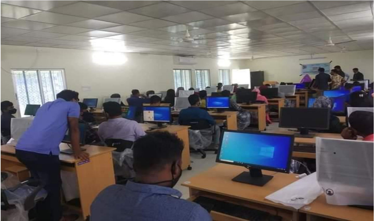
সিইডিপি এর অর্থায়নে প্রতিষ্ঠিত মাল্টিফাংশনাল আইসিটি ল্যাবে ছাত্র-ছাত্রীদের প্রশিক্ষণ