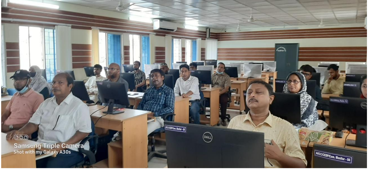
বেসিক আইসিটি এর উপর ইনহাউজ ট্রেনিং-এ সম্মানিত শিক্ষকবৃন্দ-ব্যাচ-১