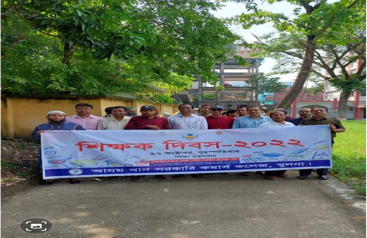
শিক্ষক দিবস -২০২২ উদযাপন