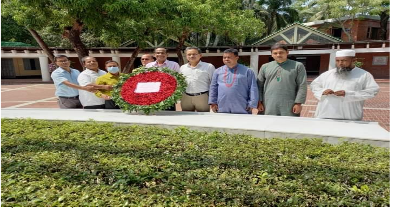
জাতির জনকের সমাধিতে অধ্যক্ষসহ শিক্ষক কর্মকর্তারা