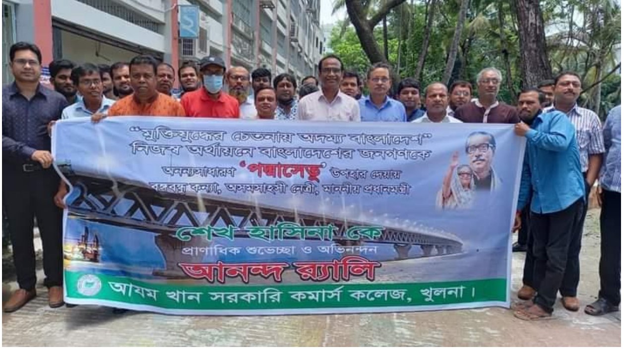
দেশের সর্ববৃহৎ প্রকল্প পদ্মাসেতু উদ্বোধনে আনন্দ র্যালি