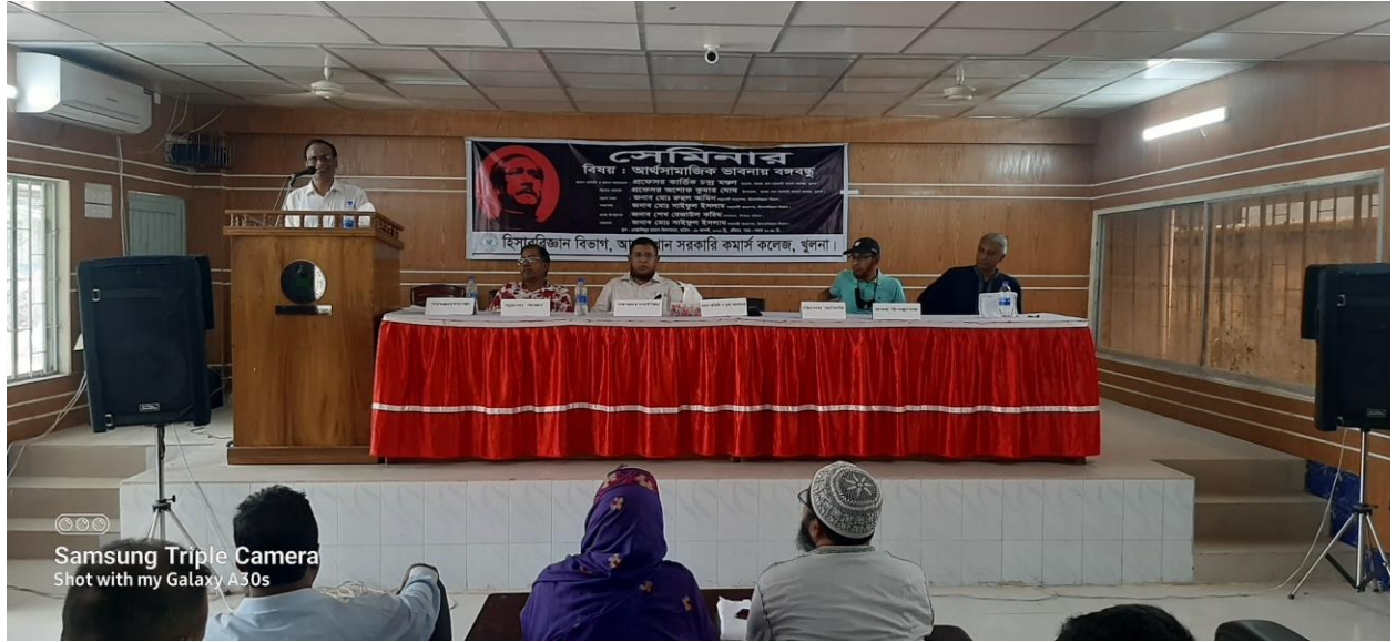
বিভাগীয় সেমিনার: আয়োজনে হিসাববিজ্ঞান বিভাগ