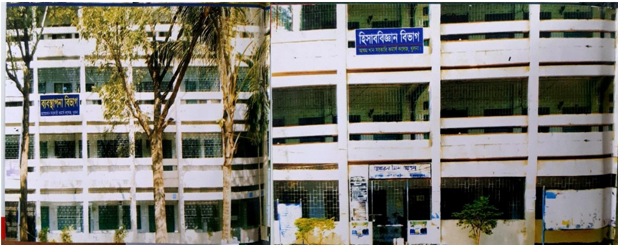
Building No.-2: Academic Building for Accounting and Management Departments