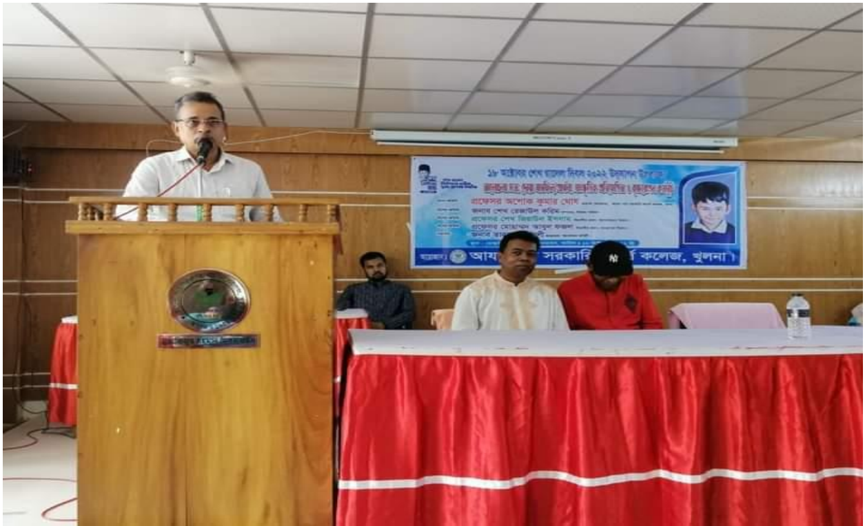
মুস্তাফিজুর রহমান মিলনায়তনে শেখ রাসেল দিবস উদযাপন