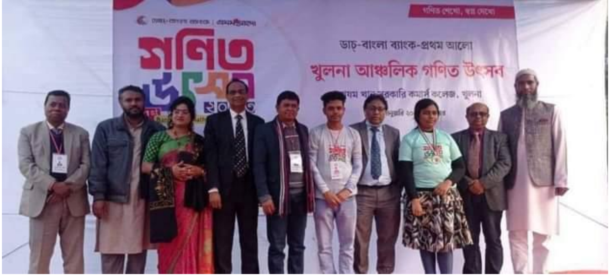
কলেজে অনুষ্ঠিত আঞ্চলিক গণিত উৎসব