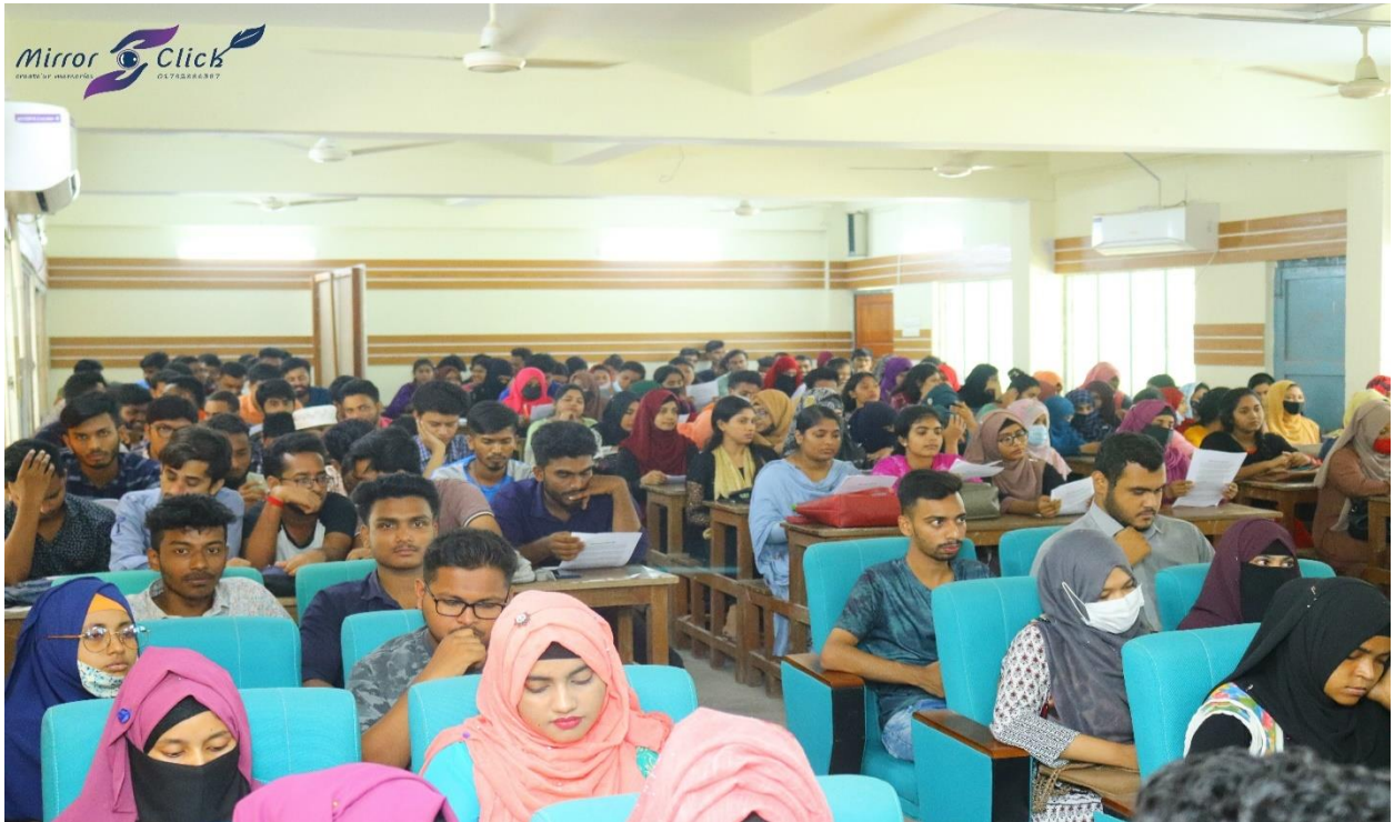
ফিন্যান্স এন্ড ব্যাংকিং বিভাগের সেমিনারে ছাত্র-ছাত্রীবৃন্দ