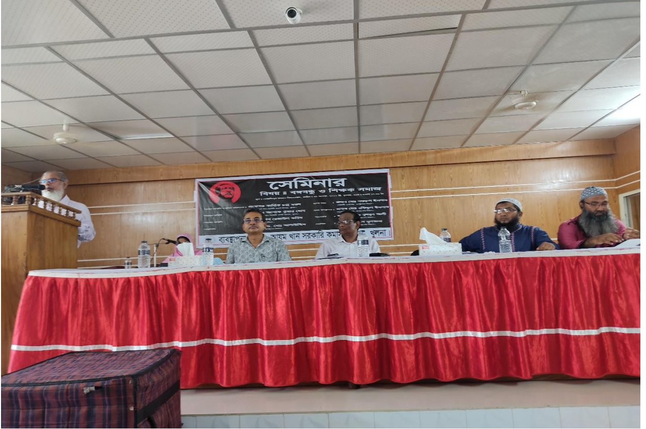
বিভাগীয় সেমিনার: আয়োজনে ব্যবস্থাপনা বিভাগ