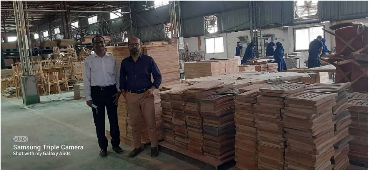
সিইডিপি এর ফার্নিচার প্যাকেজের কাজ পরিদর্শনে কারখানা পরিদর্শন