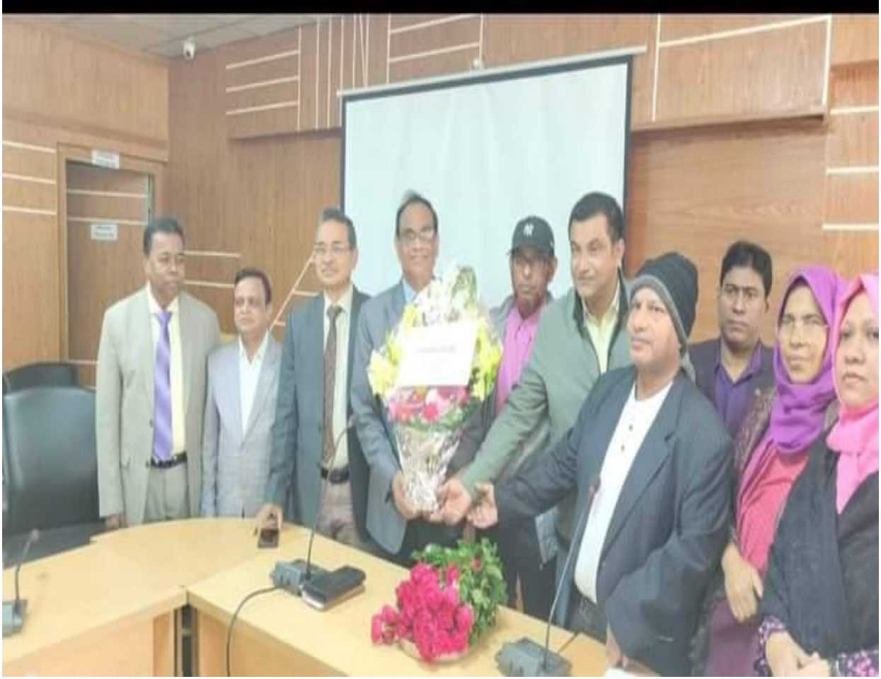
বাংলা নববর্ষের ফুলেল শুভেচ্ছা