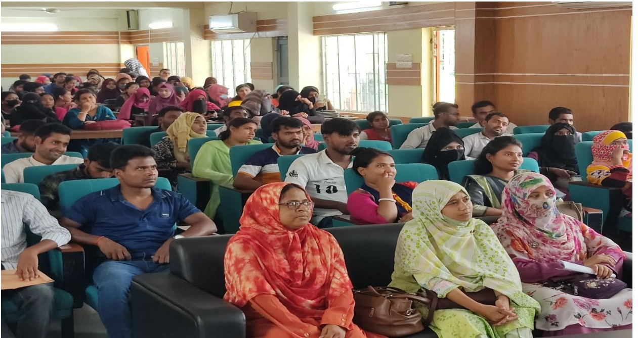
ব্যবস্থাপনা বিভাগের সেমিনারে শিক্ষক ও ছাত্র-ছাত্রীবৃন্দ