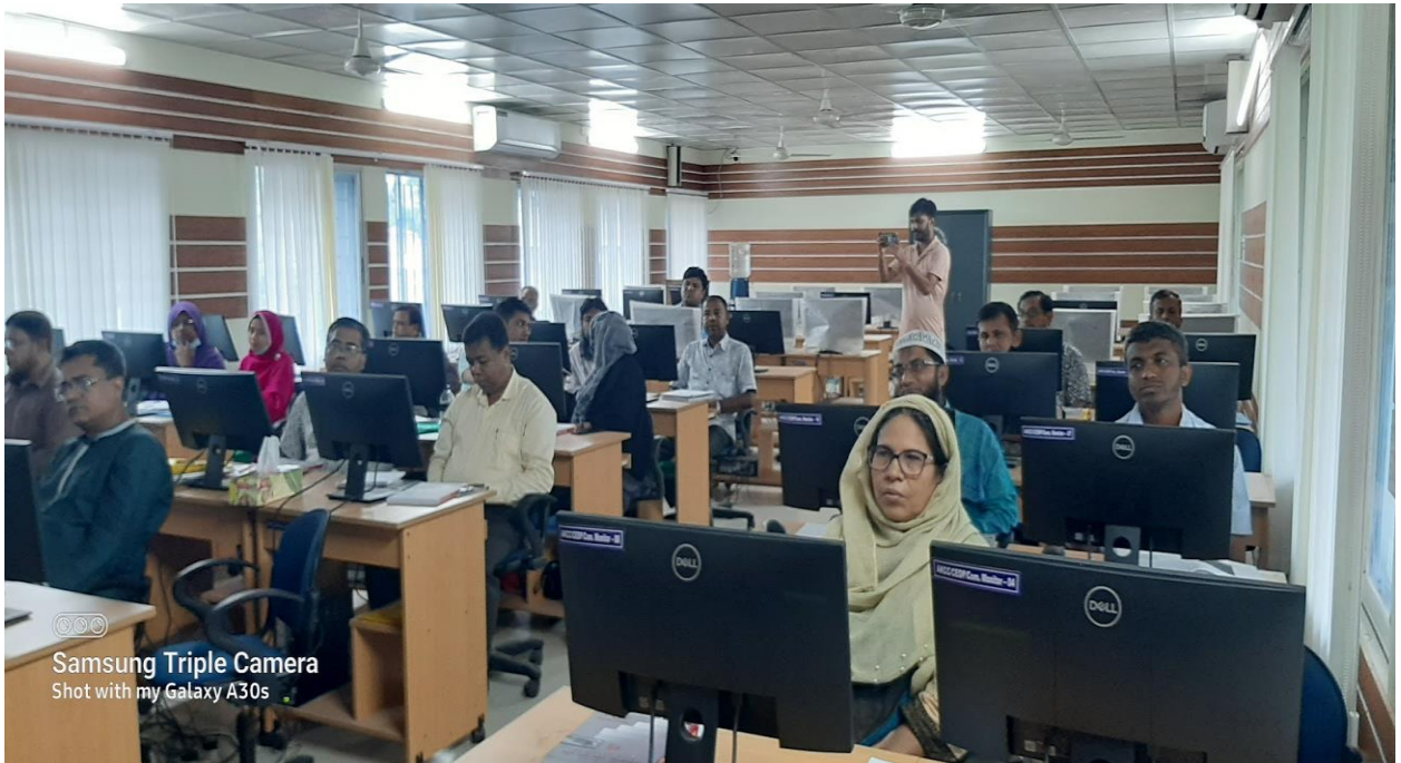
সিইডিপি এর অর্থায়নে বেসিক আইসিটি এর উপর ইনহাউজ ট্রেনিং-এ সম্মানিত শিক্ষকবৃন্দ- ব্যাচ-২