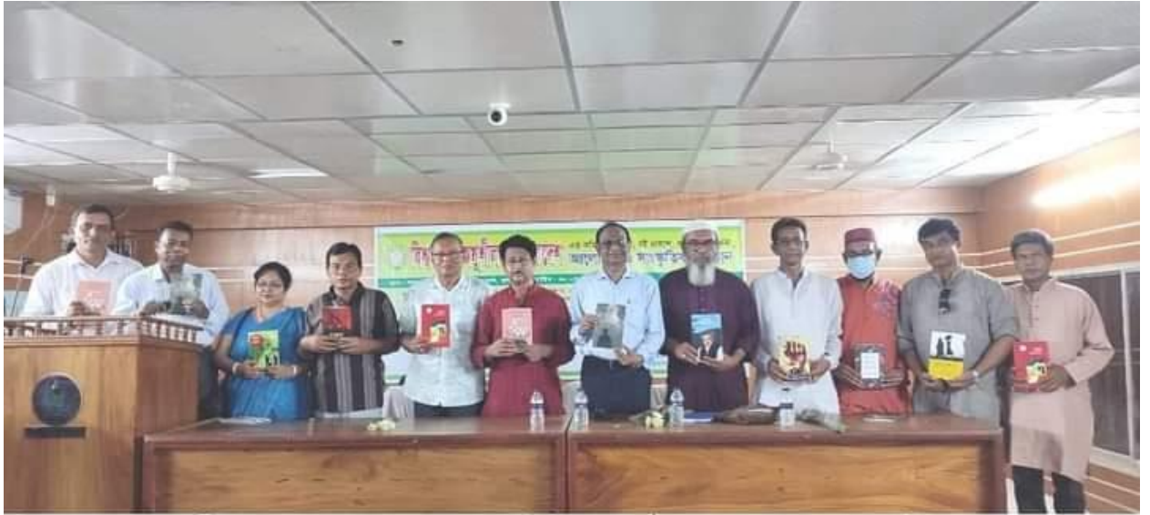
বিশ্ববাংলা অনুশীলন, বাংলাদেশ এর কমিটি পুনর্গঠন, বই প্রকাশ, গুণীজন সংবর্ধনা, আলোচনা ও সাংস্কৃতিক অনুষ্ঠানে অতিথিবৃন্দ।