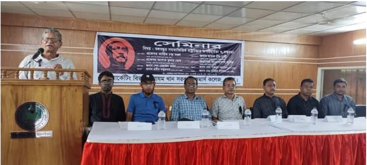
বিভাগীয় সেমিনার: আয়োজনে মার্কেটিং বিভাগ