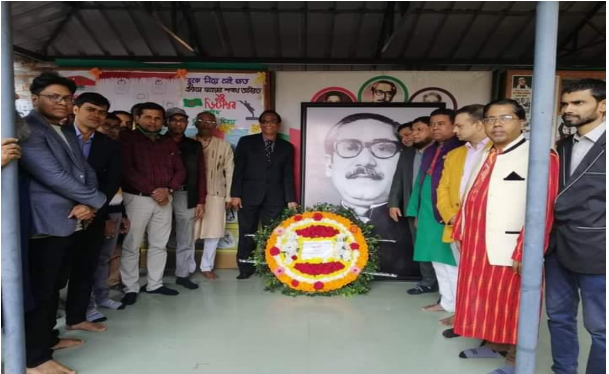
শহীদ বুদ্ধিজীবী দিবসে কলেজ চত্বরে বঙ্গবন্ধুর শ্রদ্ধাঞ্জলি অর্পণ