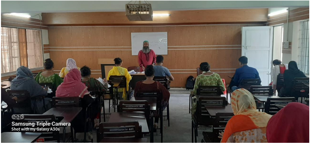
সিইডিপি এর অর্থায়নে সজ্জিত শ্রেণীকক্ষে পাঠদান