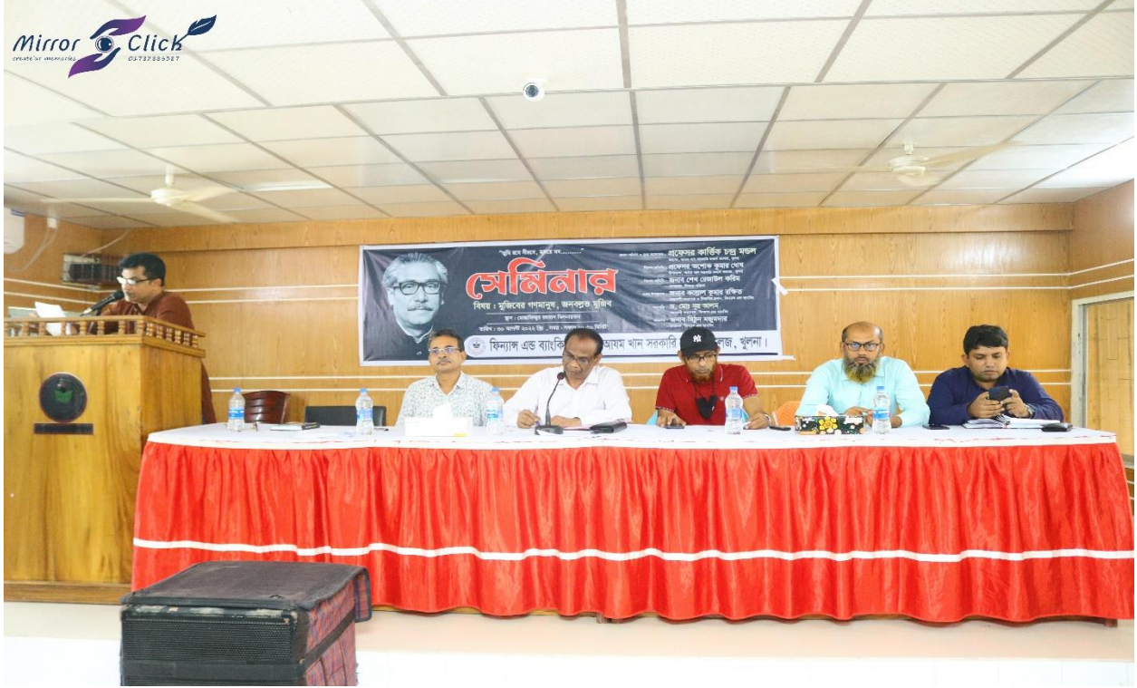
বিভাগীয় সেমিনার: আয়োজনে ফিন্যান্স এন্ড ব্যাংকিং বিভাগ