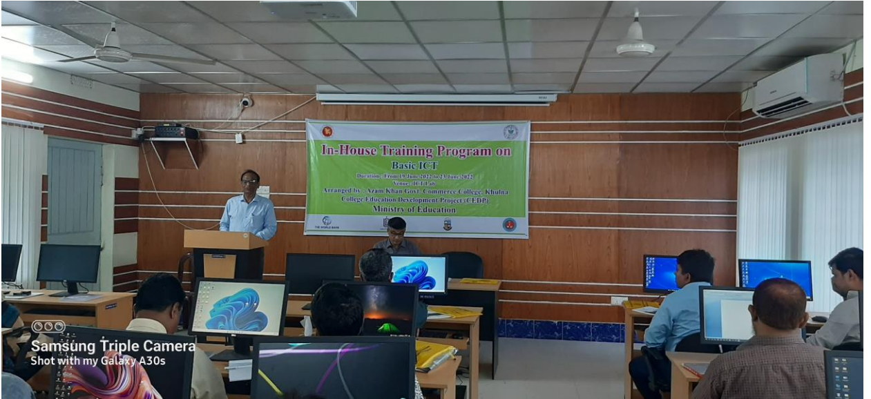
সিইডিপি এর অর্থায়নে বেসিক আইসিটি এর উপর ইনহাউজ ট্রেনিং-এর উদ্বোধনী অনুষ্ঠান