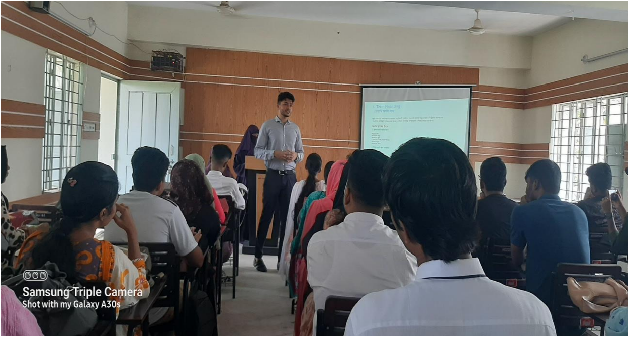
ছাত্র-ছাত্রীদের দ্বারা পাওয়ার পয়েন্ট প্রেজেন্টেশন