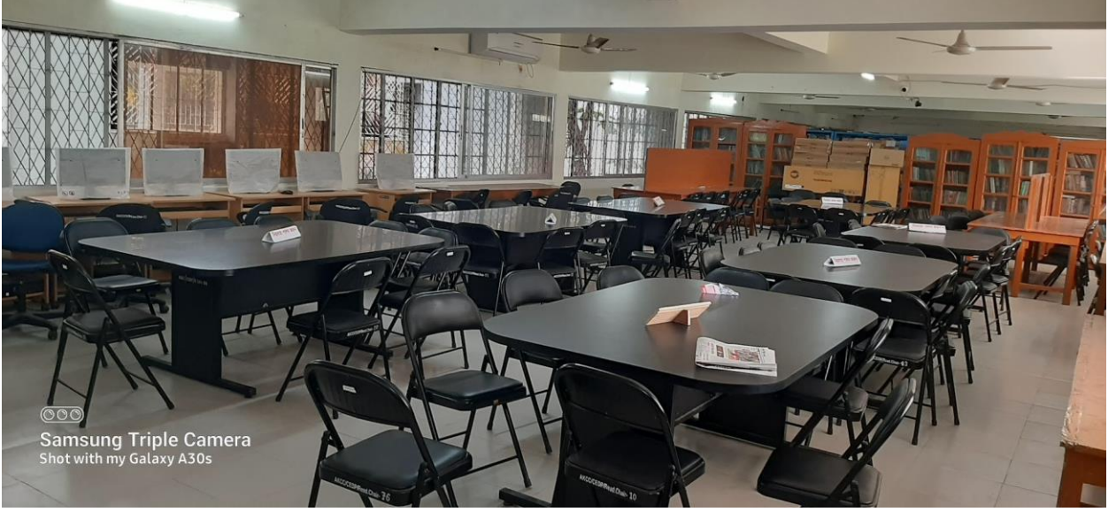
সিইডিপি এর অর্থায়নে কলেজের কেন্দ্রীয় লাইব্রেরী