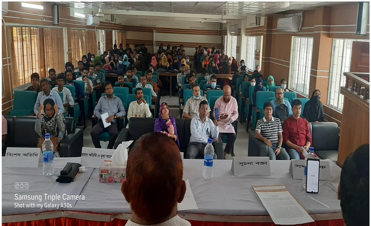
হিসাববিজ্ঞান বিভাগের আয়োজনে সেমিনারে ছাত্র-ছাত্রীবৃন্দ