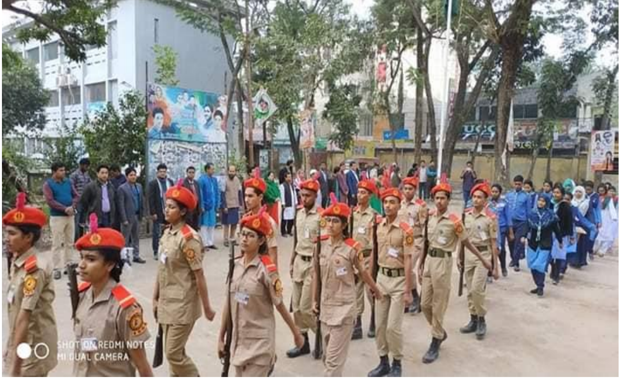
মহান বিজয় দিবস উদযাপন উপলক্ষে কুজকাওয়াজ