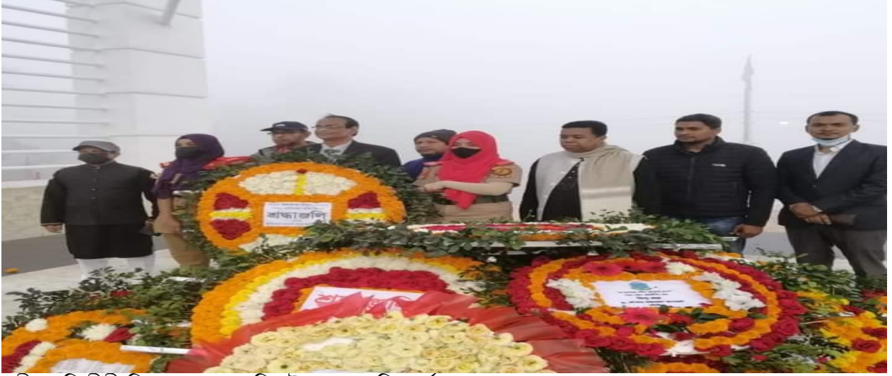
শহীদ বুদ্ধিজীবী দিবসে খুলনা স্মৃতিসৌধে শ্রদ্ধাঞ্জলি অর্পণ