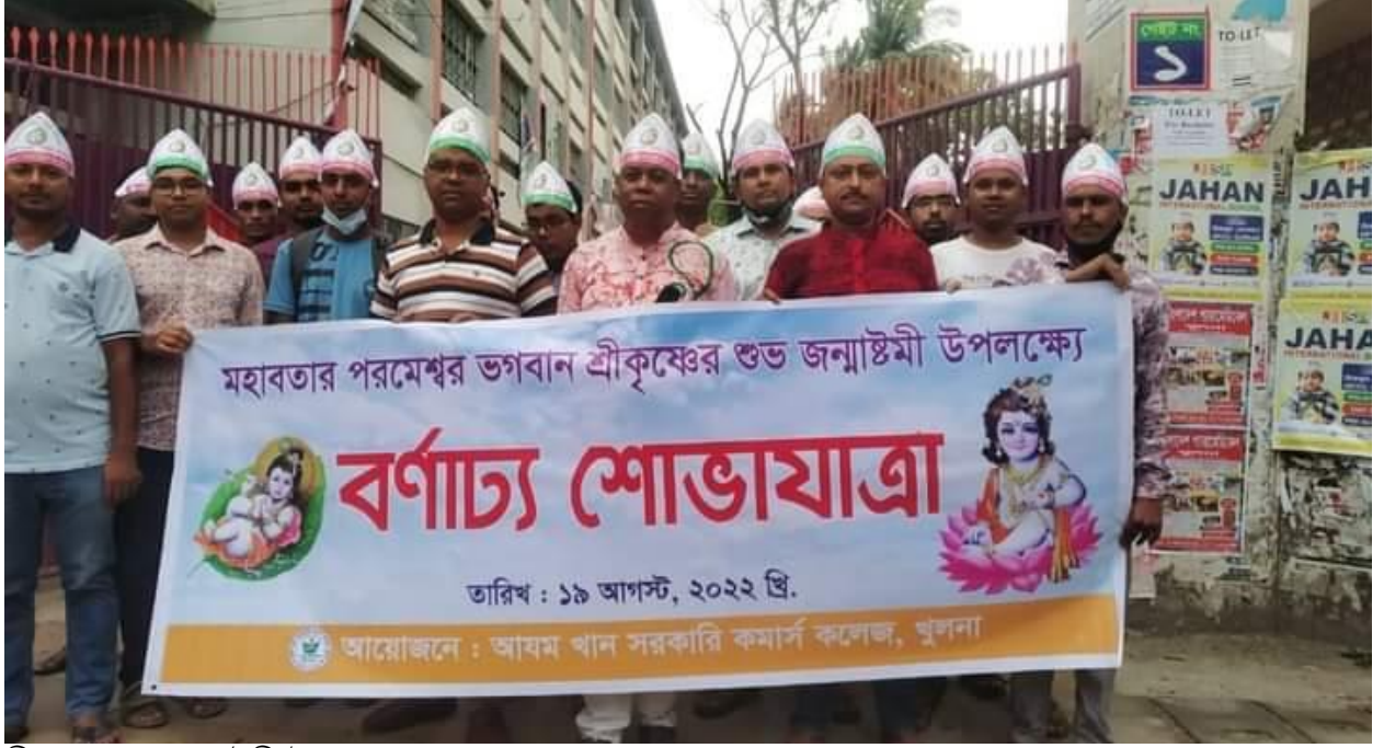
শ্রীকৃষ্ণের শুভ জন্মাষ্টমী উপলক্ষ্যে শোভাযাত্রা