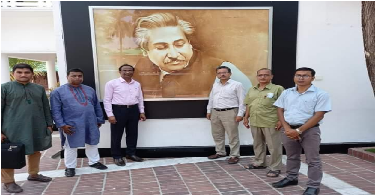
জাতির জনকের সমাধিসৌধে অধ্যক্ষ, উপাধ্যক্ষ ও শিক্ষকবৃন্দ