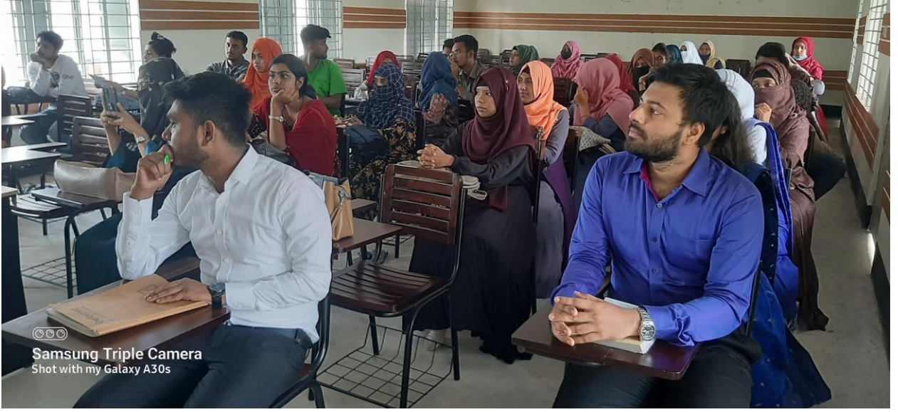
ছাত্র-ছাত্রীদের দ্বারা পাওয়ার পয়েন্ট প্রেজেন্টেশন ক্লাসের একাংশ