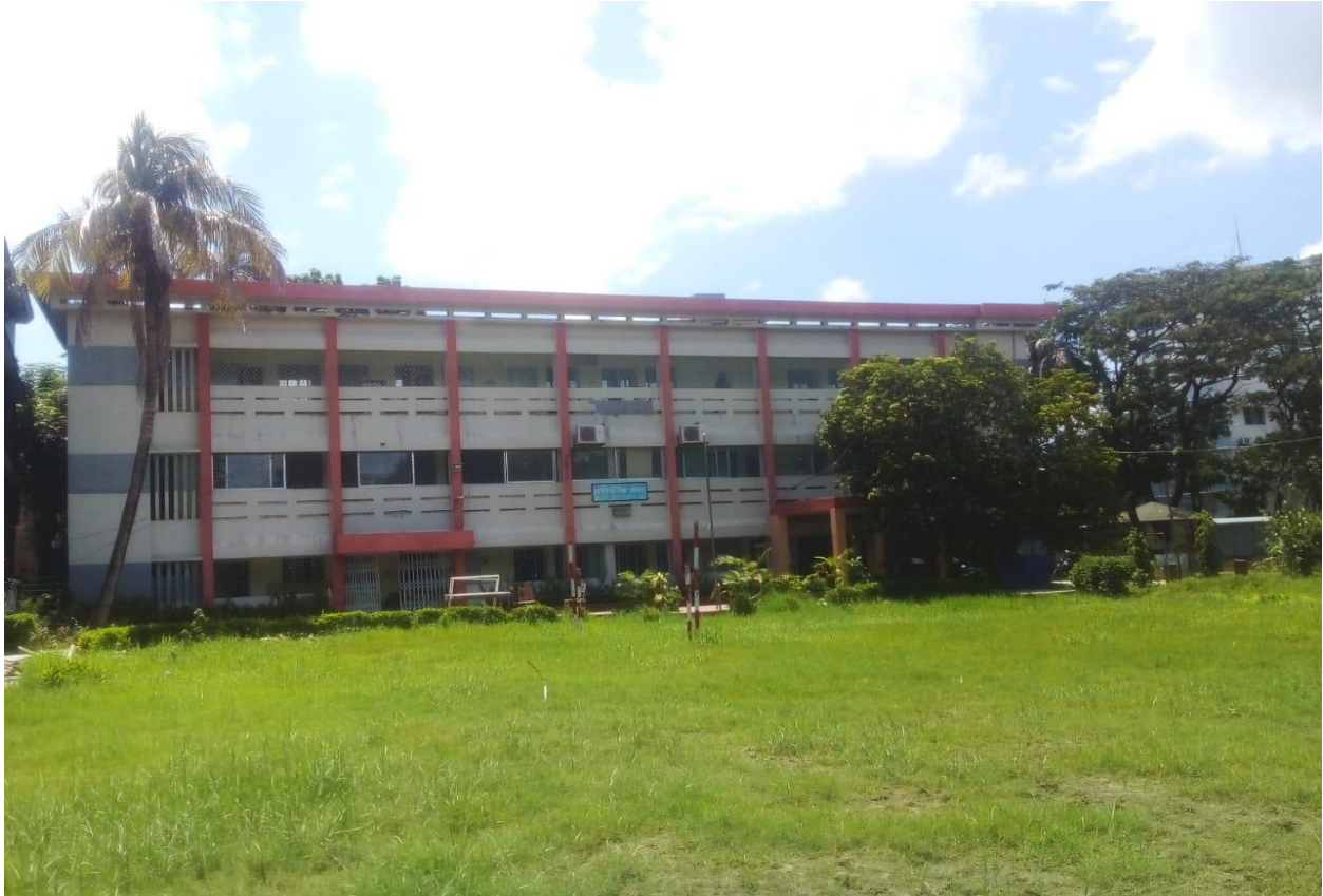
Building No.-3: Administrative Building