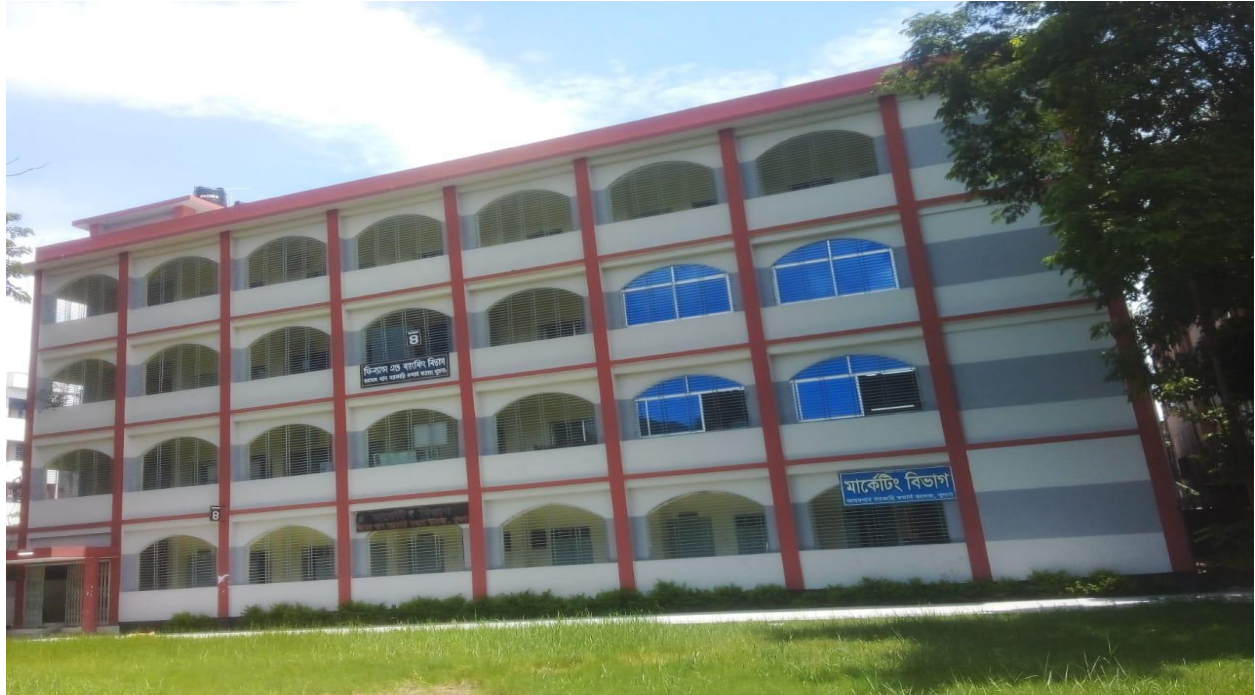
Building No.-4: Academic Building for Marketing and Finance & Banking Departments