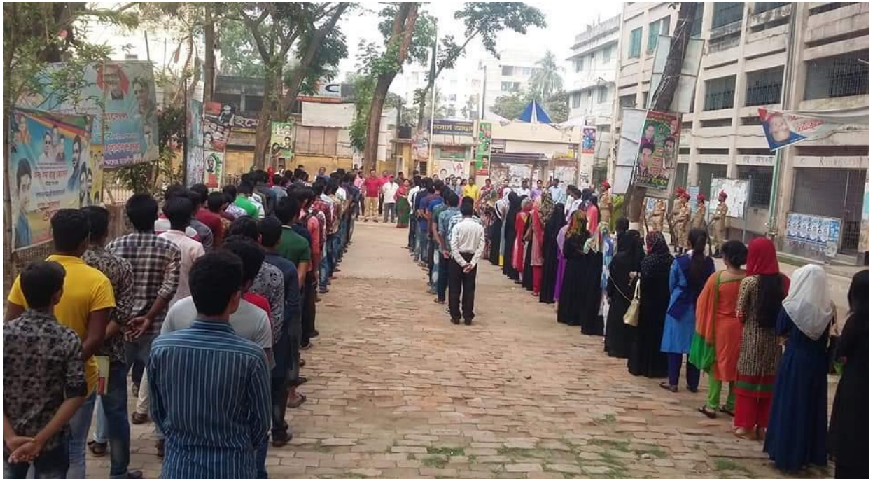
মহান স্বাধীনতা দিবসে সমবেত কণ্ঠে জাতীয় সংগীত