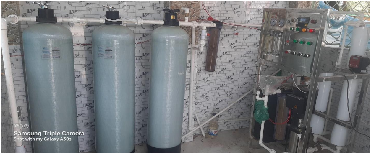
সিইডিপি এর অর্থায়নে বিশুদ্ধ খাবার পানির পরিশোধন প্লান্ট