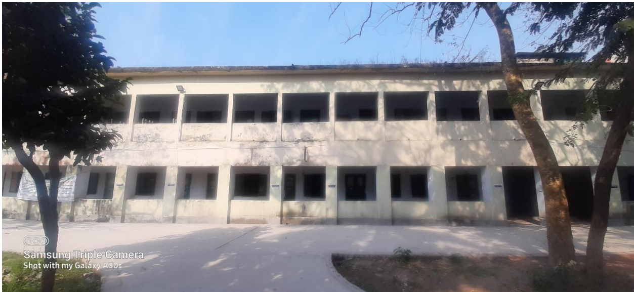
Building No.-1: Academic Building for HSC and Degree